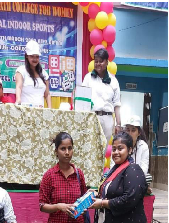
College Annual Sports