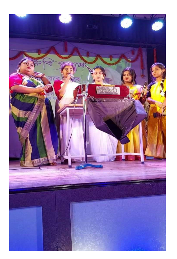
Cultural programme at the college auditorium by students