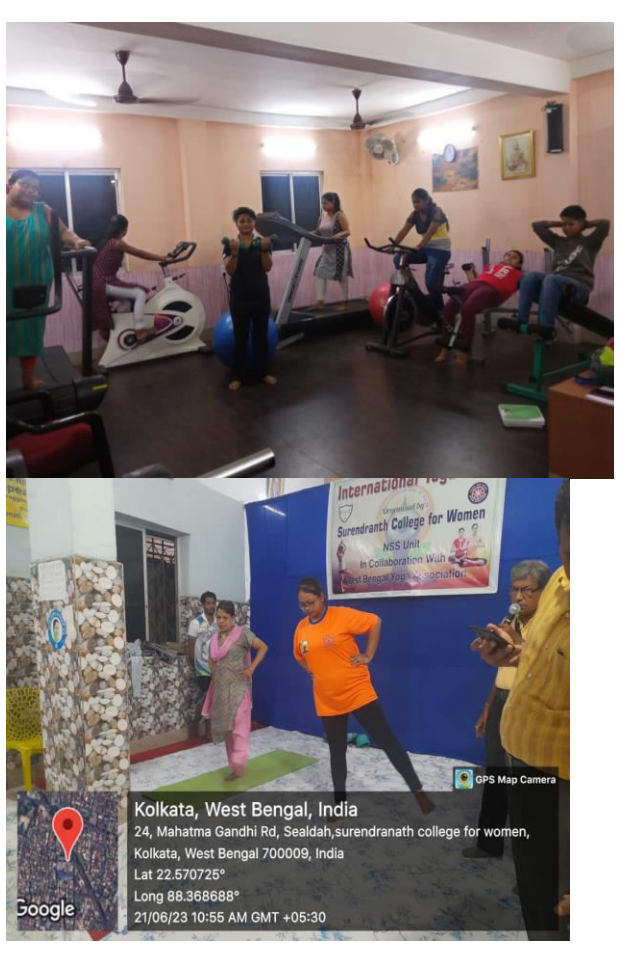
Work-out by girls in the college gymnasium

The college has a fully automated gymnasium in the ground floor. The gymnasium remains open for three days of a week – Monday, Wednesday and Friday for all the students of the college. The gymnasium has a capacity intake of 15 girls at a time. The college has also appointed one female trainer to guide and supervise the students. The gym is fully equipped with two trade mills (one electronic, one manual), one twister, two cycles, two seat-up machines, four mini bumbles, four skipping and two cardio balls.