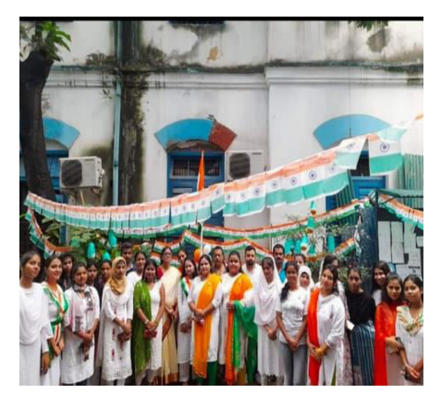
Celebration of Independence Day